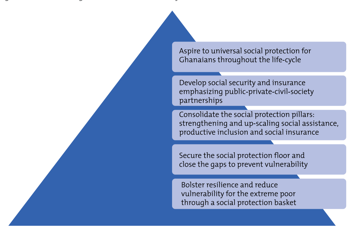
Figure 1: Ghana's Envisaged Social Protection Journey

The policy proposes an initial phased approach over the first fifteen (15) years and is broken down into three phased terms (see Figure 2 below).